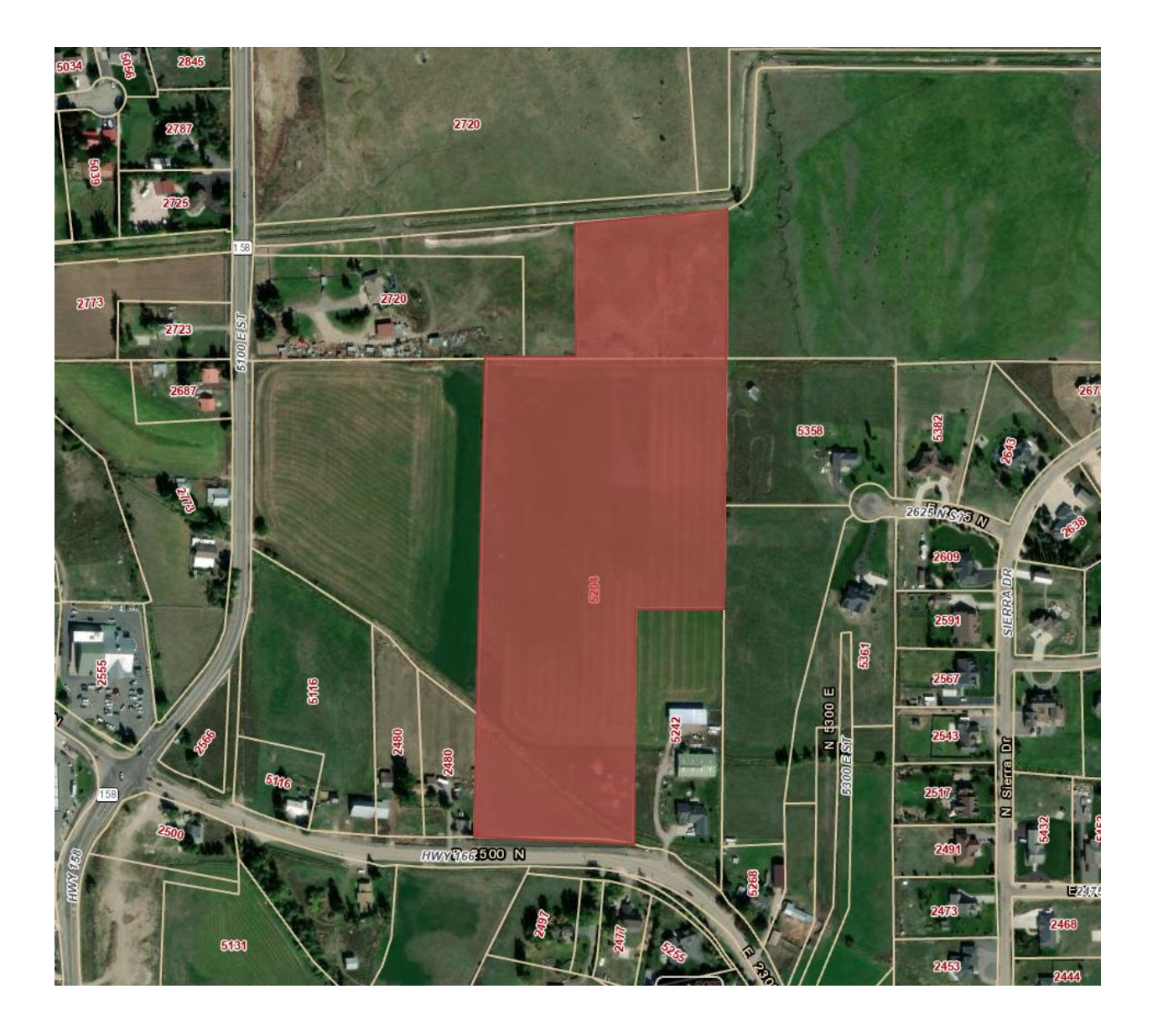
Exhibit B: Map of Property